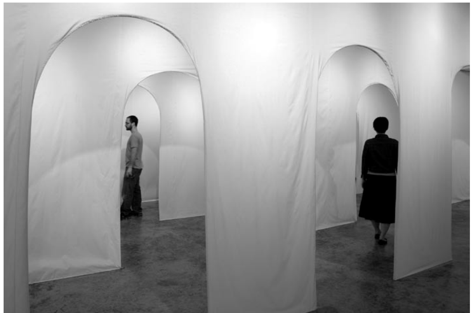
Installation view of Yellow Labyrinth , 2007. Yellow fabric and wood. 1700 sq. ft.

Nagasaka wants to make viewers aware of their own role in the process of experiencing art. Like the drop-dead beautiful installations of