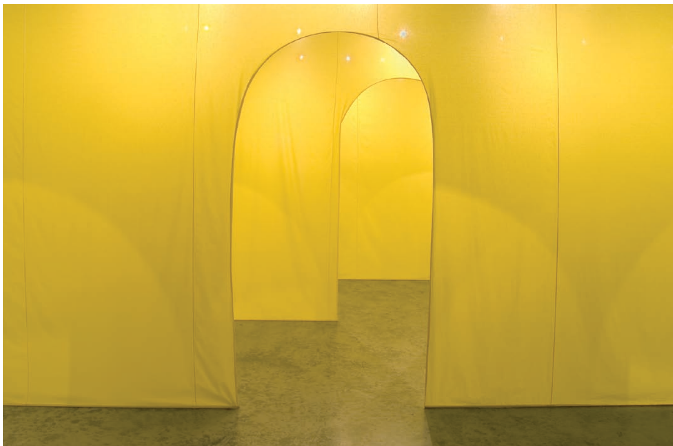
Installation view of Yellow Labyrinth , 2007. Yellow fabric and wood. 1700 sq. ft.