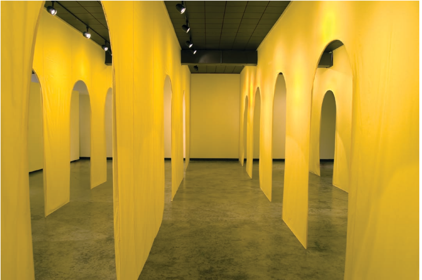
This Panel: Installation view of Yellow Labyrinth , 2007. Yellow fabric and wood. 1700 sq. ft. Cover Panel: Installation view of Yellow Labyrinth , 2007. Yellow fabric and wood. 1700 sq. ft.